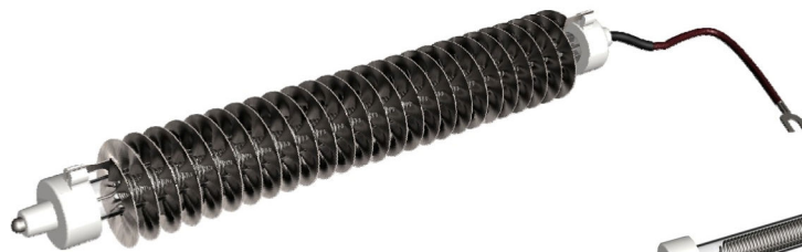
Competitor Infrared Heating Element